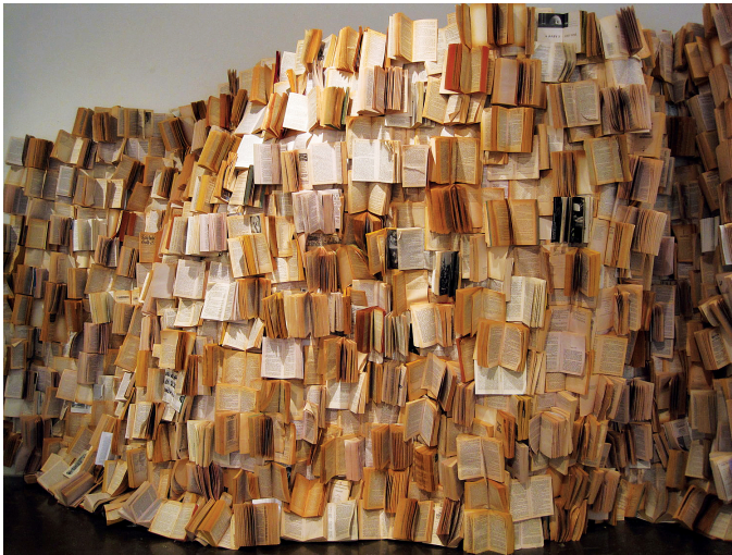
Olga Lah's Translation