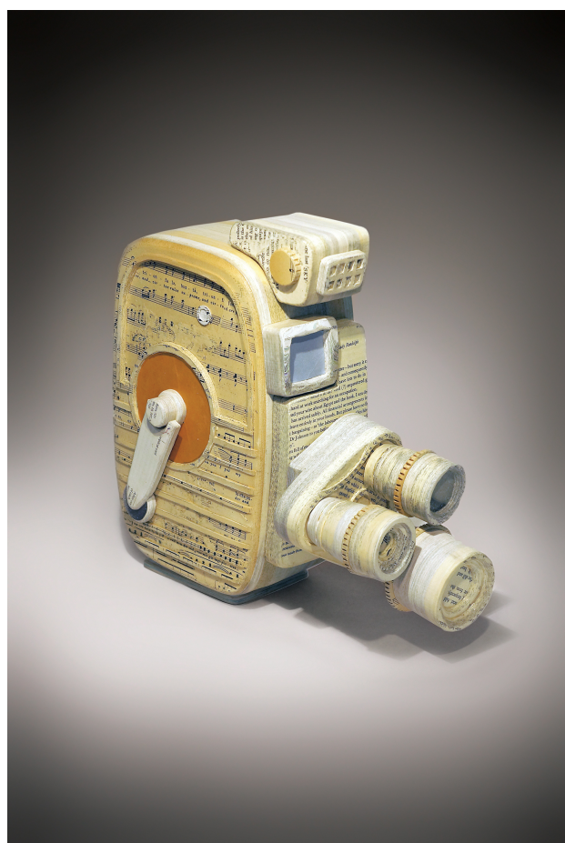
Ching Ching Cheng's Keystone K313